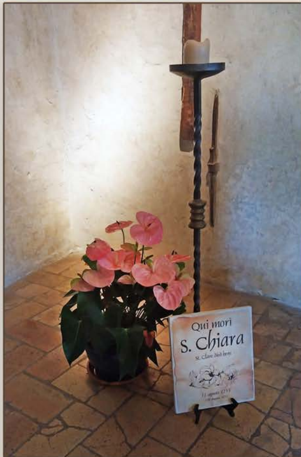
Memorial at location of St. Clare's death

"My pilgrimage to Assisi had many special times. I spent special time before the tomb of St. Francis and that of Clare, as well as time in the small Portiuncula Chapel in St. Mary of the Angels. These were special prayer times as well as in Greccio and San Damiano. There was a special energy in all these places for me."