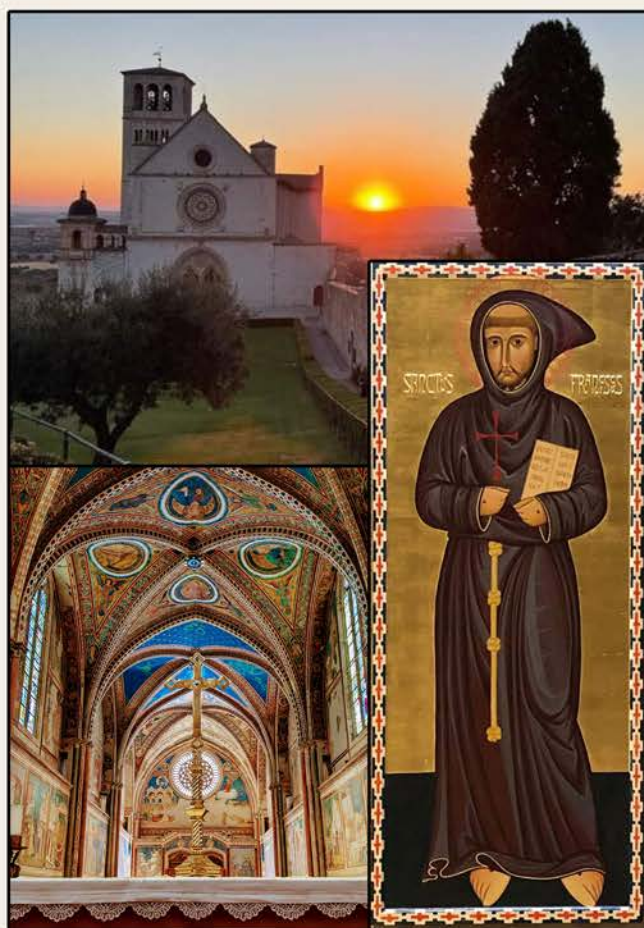
Basilica di San Francesco (the Basilica of St. Francis)

Two other important places in the city of Assisi are the Basilicas! At the northwest end of Assisi sits the Basilica di San Francesco (the Basilica of St. Francis). It is an amazing structure that contains the tomb of St. Francis as well as many altars and magnificent works of religious art. One could spend hours looking at and studying the beauty of this place. It strikes me that this structure is probably not what Francis would want. Legend tells us that Francis wanted to be buried in the most despised spot in Assisi. Yet, after his canonization, his remains were brought here. Beckoning visitors from around the globe, the Basilica di San Francesco is seen as a source of grace and new life for people of all backgrounds and cultures.