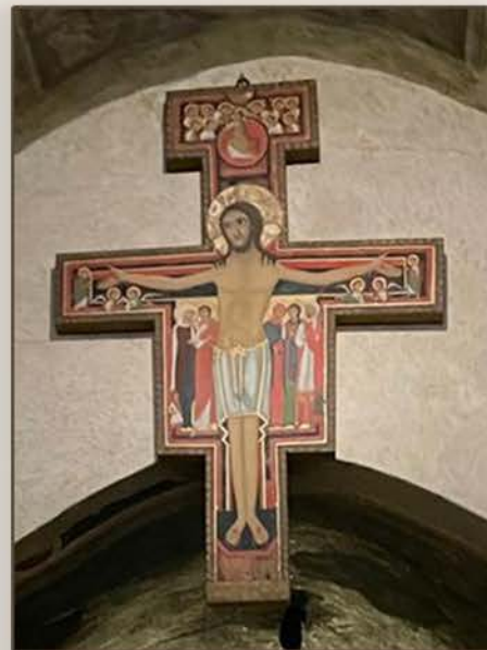
San Damiano Cross

"Chapel of the Nativity in Greccio located in a cave profoundly deepened my incarnational spirituality that influenced my theology teaching at XLI and prayer. Anointing of hands at San Damiano dormitory eventually called me to the healing ministry and led to new courses at XLI and offering workshops and retreats. St. Clare guided all my sessions on healing."