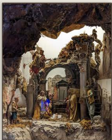
Nativity in Greccio