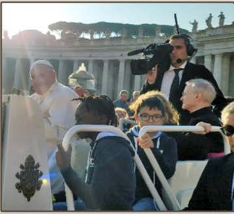
Pope Francis with children

"Going to the Square was the one of the most exciting parts of the pilgrimage, God answering the desire of my heart, was seeing Pope Francis. In the picture above, you see an African American little girl in his Mobile and children of different ethnic backgrounds. That stole my heart, because to me Pope Francis was making a statement that said all children of the world are children of God. Where so many times Black People are made to feel less than or unimportant, Pope Francis was saying to the world how he feels as what God wants in this world. Oh! that made my whole trip! ...and it hadn't even gotten started yet. He blessed all the articles we were holding in our hands. That made me happy because we had just come from Eucharist and going through the Basilica."