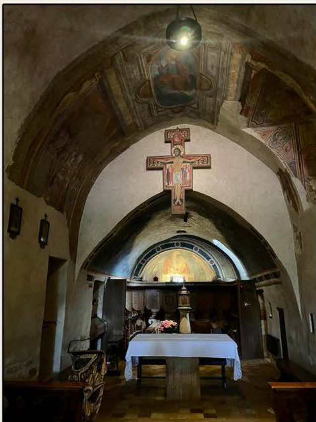
San Damiano Cross housed in the Basilica of St. Clare

One day, we walked down the hill to San Damiano. We enjoyed a beautiful hike through the countryside, realizing that this trek would have been much more treacherous in the time of Francis and Clare. San Damiano is important to Franciscans because this was the church that held the icon before which Francis was praying when he heard the call to rebuild the church. This is also where Clare lived with her sisters for over 40 years. It is a simple stone building surrounded by beauty. The original icon we call the San Damiano Cross is now housed in the Basilica of St. Clare. This seems fitting since Clare prayed in front of this cross for over 40 years. There is a replica of this icon/cross in the chapel at San Damiano.