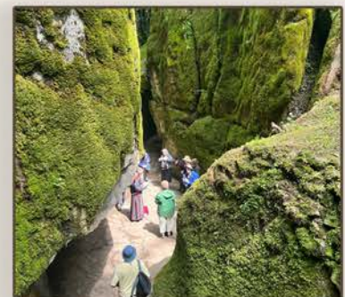
Mt. La Verna