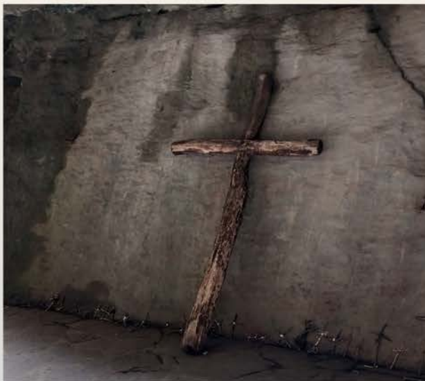
Cave where St. Francis prayed on Mt. La Verna