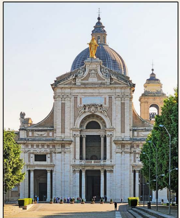
Basilica of Saint Mary of the Angels (Santa Maria degli Angeli)

(*Porziuncola is the Italian spelling of the English version Portiuncula.)