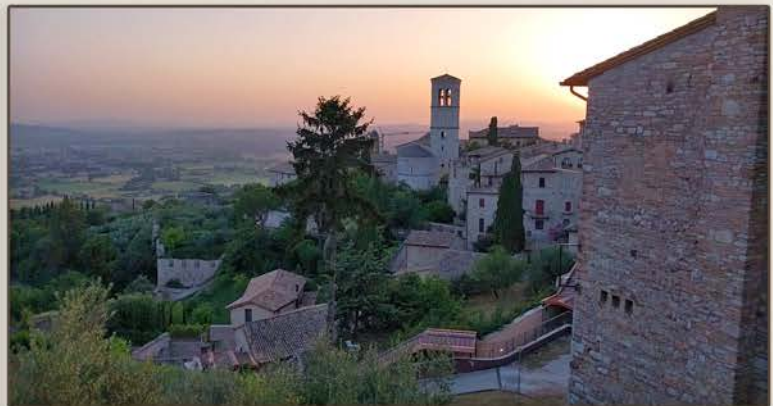
Assisi at dusk