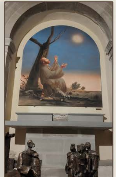
Chapel of the Stigmata, Mt. La Verna

"Perhaps my favorite spot in Assisi is Mt. La Verna. Descending the steps into the heart of the mountain—how could one help but praise God for the beauty of creation?"