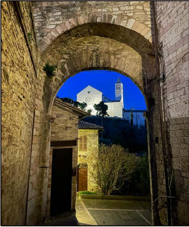
Basilica di Santa Chiara (the Basilica of St. Clare)

At the southeast end of Assisi, we find the Basilica di Santa Chiara (the Basilica of St. Clare). This structure, smaller than the Basilica of St. Francis, is built around the remains of the little parish church where Francis received his education. The façade is made of pink and white stone from Subasio. The interior structure is much like that of the Basilica of St. Francis. The (original) San Damiano Cross hangs in a side prayer chapel (The Chapel of the Crucifix). The tavola of St. Clare hangs inside the Basilica, reminding visitors of the important events in her life. The tomb of St. Clare is in the Basilica. This is another magnificent structure that Clare would likely not think fitting for her. Her desire to live voluntary poverty seems a direct contradiction to this huge church. Yet, this building serves as a reminder to us that we are called to continue the unfolding story of the Franciscan tradition. We are reminded that we, too, have a call and must listen to the voice of God.