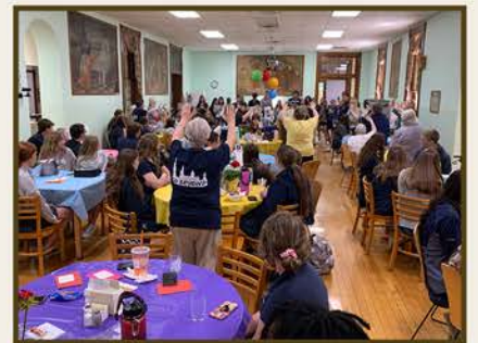
Sisters blessing the students