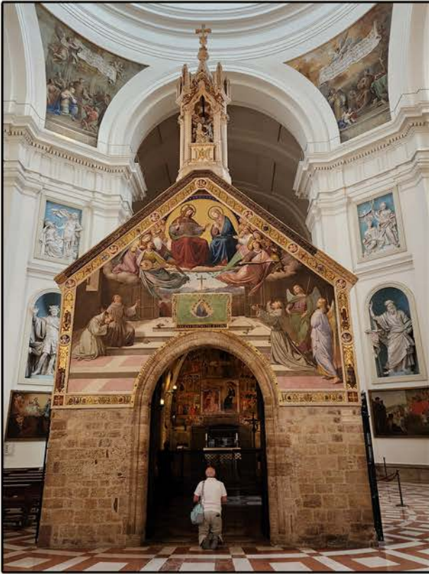
Porziuncola (or Little Church)